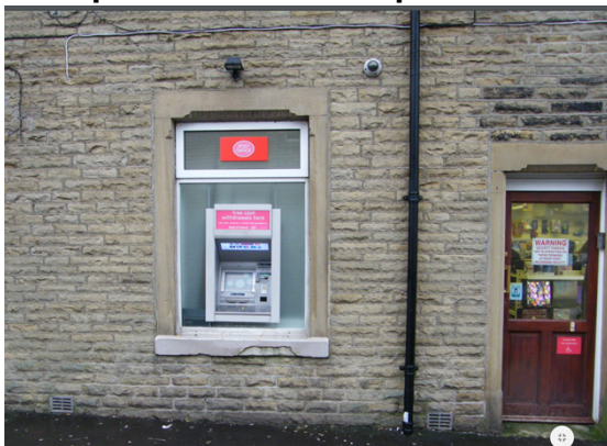
ATM prior to incident April 2017